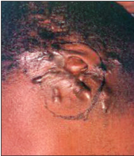
Figure 7. Drawing the shape of the intact ear on the defect side in the same orientation.