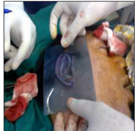
Figure 15. Drawing the ear on radiographic film on the normal side.