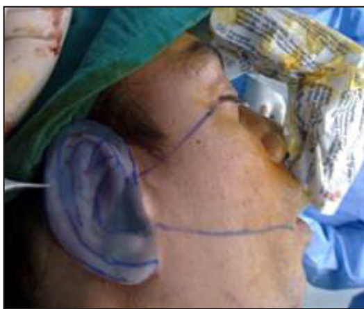
Figure 16. Orientation of the normal ear to the canthus of the eye and corner of the mouth.