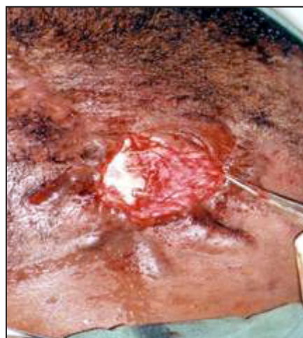
Figure 11. Three implants in place with their cover screws.