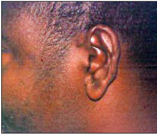
Figure 2. The left intact ear.