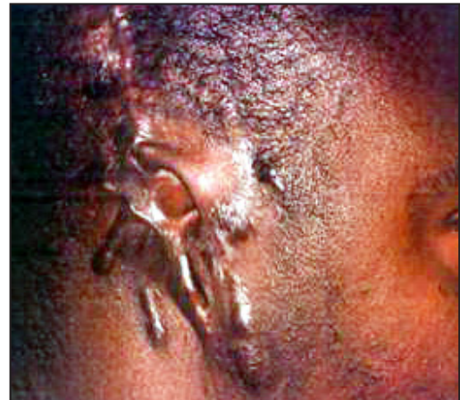
Figure 3. Scar tissue at the defect side from previous closure of the wound with many lumps.

was conducted under general anaesthesia after admission of the patient in a hospital session for overnight.