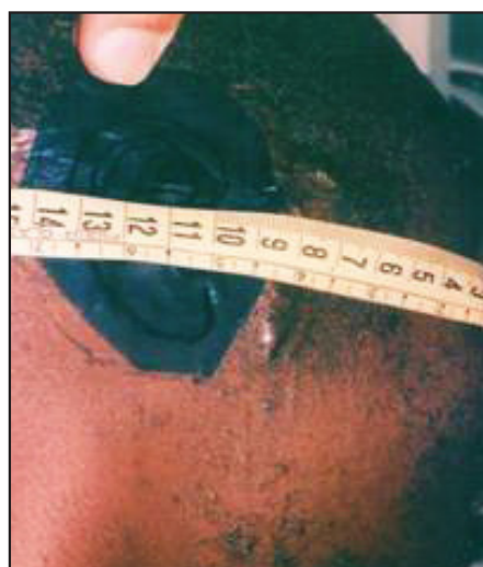
Figure 5. Measuring distances to the canthus of the eye.