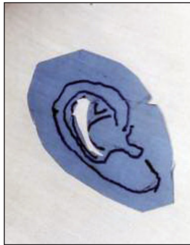
Figure 8. Making a groove for placement of the implants within the antihelix of the ear.