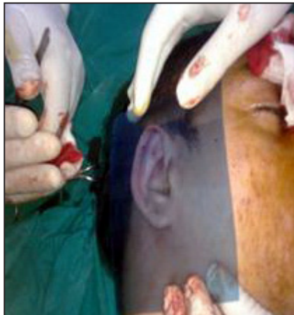
Figure 14. Positioning the radiographic film on the normal side.