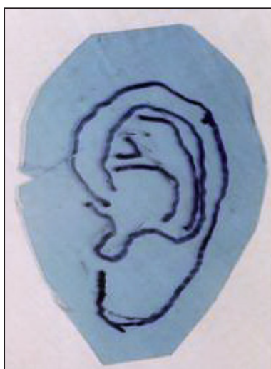
Figure 4. Drawing of the intact ear on transparent celluloid paper.

area for the right ear and from 1 o'clock to 3 o'clock position for the left ear. This film is used as a surgical template to place the implants in their anticipated correct position in relation to anatomic features of the face and to the final ear prosthesis (Figures 8, 9) [1]. A full thickness flap was reflected by a plastic surgeon and potential implant sites were evaluated with the help of the surgical template made from the drawn intact ear on the radiographic film. A series of drills from ANKYLOS EO Extraoral Implant System by Degussa Dental (A DENTSPLY International Company Degussa Dental GmbH, Germany) were used with maximum r.p.m. of 800 with copious irrigation with saline to avoid the risk of localized overheating of the bone. The drilling was carried out according to the manufacturer's instructions to prepare the osteotomy sites for insertion of craniofacial implants. Three 6 mm length implants were inserted very slowly with the aid of ratchet insert for implant and was guided to position by an open-end wrench till its final position.