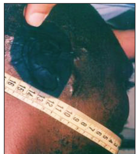
Figure 6. Measuring distance to the corner of the mouth.