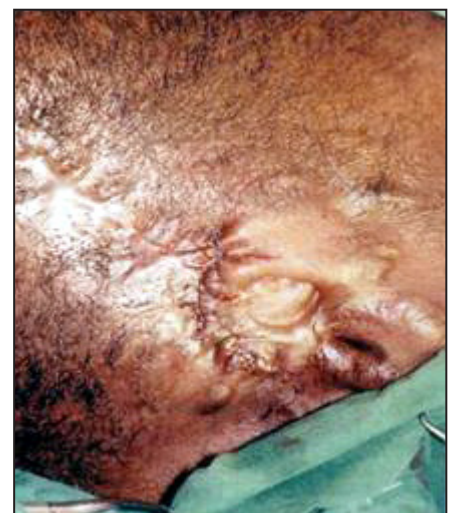
Figure 12. Final closure of the surgical site.