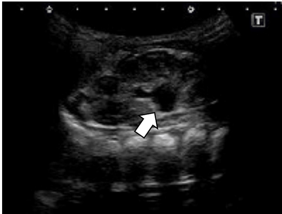
FIGURE 1: Ultrasound imaging

Ultrasonography showing a mild expansion of the renal pelvis of the left kidney (arrow), which was classified as mild hydronephrosis based on the Society for Fetal Urology (SFU) grading system (grade 1)