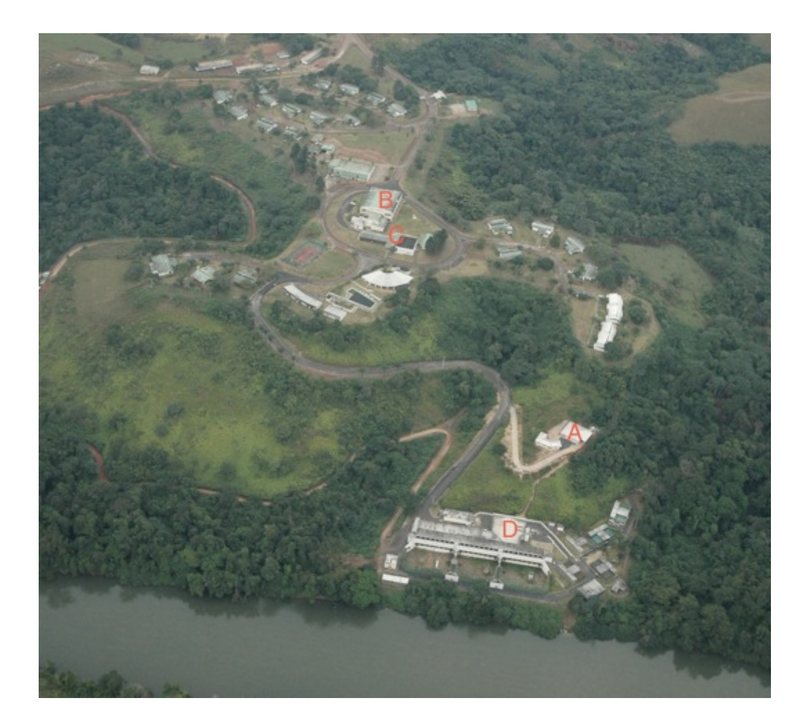
Figure 1. The International Centre for Medical Research of Franceville (CIRMF). Campus aerial view: the P4 laboratory: \mathbf{A} = P4 laboratory facilities; \mathbf{B} = Main Building; \mathbf{C} = P3 Laboratory; \mathbf{D} = Primatology Center.

In the 1990s, viral hemorrhagic fevers became a focus of attention in Equatorial. The decision to develop a high security laboratory for the study of Ebola virus disease came after a 1996 Ebola virus disease outbreak in Mayibout area, Gabon. The main objective was to develop the potential for rapid and specific diagnosis on viral hemorrhagic fevers and to have a backup for field investigation of severe viral hemorrhagic fever epidemics. Because the unique expertise and interaction of the CIRMF team along with the international World Health Organization (WHO) teams for Ebola virus disease, the Gabonese government agreed to such a project. The first BSL3+ (including negative pressure and glove box) laboratory was built in 1997, mostly financed by the Foreign Ministry of France (Figure 2). This laboratory was built in a period of quasi "emergence" of successive Ebola virus disease outbreaks