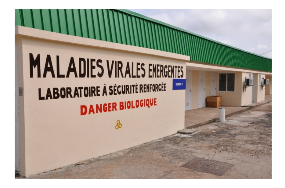
Figure 3. The Present CIRMF High Security P4 Laboratory with "Glove Box".

Figure 2. The International Centre for Medical Research of Franceville (CIRMF). Emerging Viral Diseases Unit P3 laboratory.