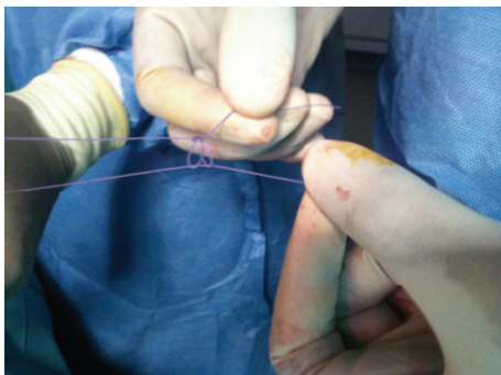
FIGURE 3: Extracorporeal knot used for ligation of the base of the appendix.

trocars (Figure 4). Depending on the case a suction-washing is optionally performed with a drainage (Figure 5). The trocars are removed under direct vision followed by a full exsufflation pneumoperitoneum. Umbilical foramen is tight in order to close the opening fascia. Trocar orifices of 5 mm are closed by 1 or 2 points of resorbable wire 4/0. A bandage is placed on the umbilicus for a period of 5 days.