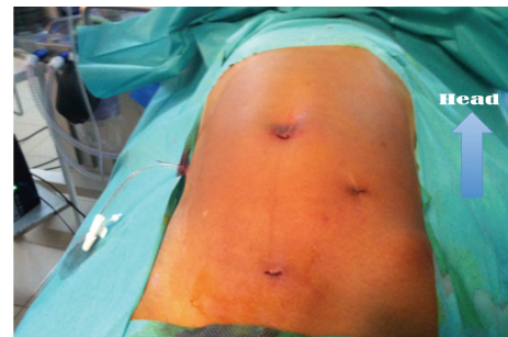
FIGURE 5: Appendicular peritonitis operated laparoscopically and drained.

All patients were operated on by the same surgeon. The parameters studied were age, sex, clinical data, laboratory features, radiological data, and results of surgical treatment.