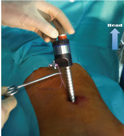
FIGURE 1: Open coeloscopy (umbilical trocar fixation during laparoscopic appendectomy).