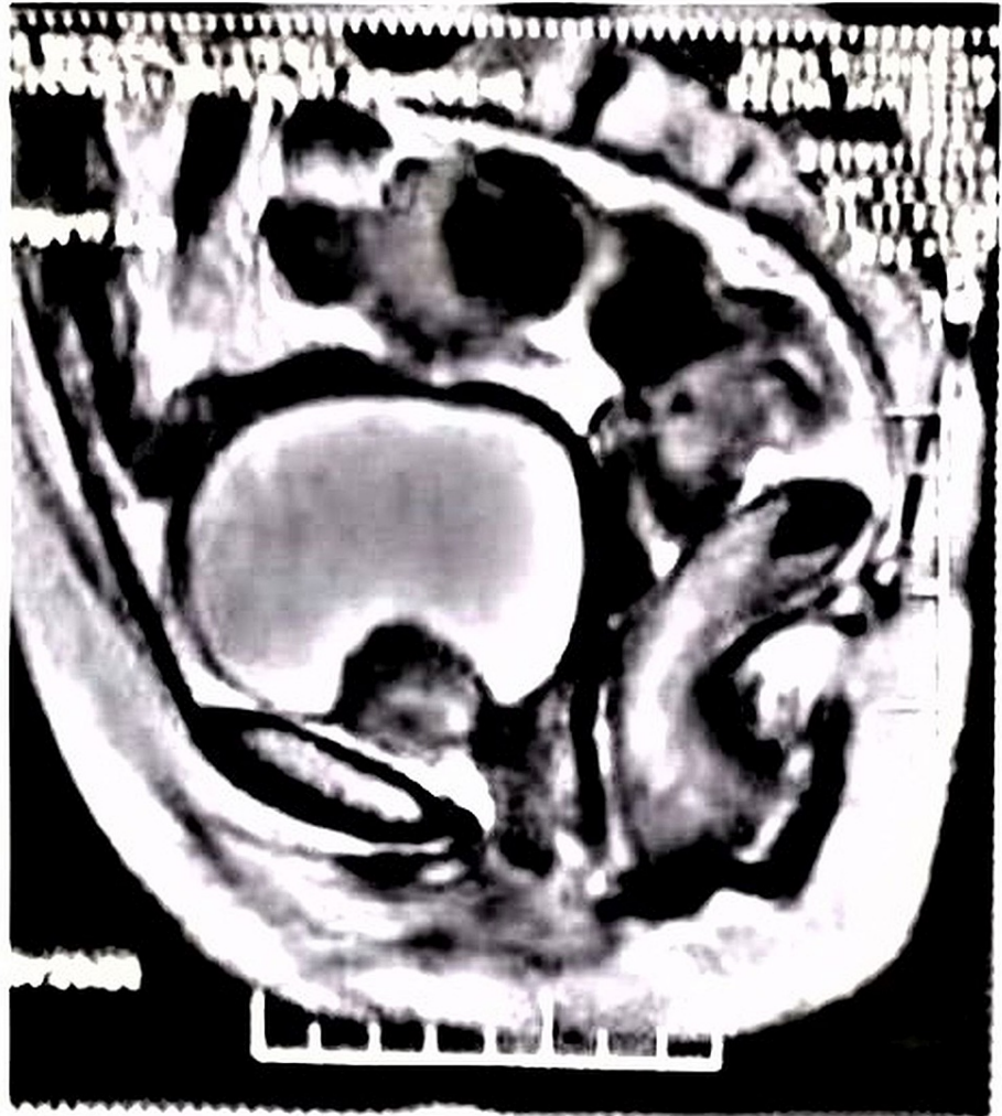
FIGURE 1: Contrast-enhanced computed tomography (CECT) image - Lobulated tumor mass arising from the base of urinary bladder and protruding into the cavity.

MRI pelvis showed a well-defined lobulated avidly enhancing submucosal bladder mass anterior to the urethral opening. Urine culture was negative. A transurethral resection of bladder tumor (TURBT) was given for histopathological examination, and the report rendered was suggestive of neuroendocrine tumor. Later on, a robotic excision of bladder mass was done and sent for histopathological examination. Grossly the specimen was yellow-tan lobulated mass measuring 3.5x3x2cm. On cutting open, homogenous greyish-yellow areas were noted. Microscopy showed tumor cells arranged in sheets and nests. Individual cells showed mild to moderate nuclear pleomorphism, with a round to oval vesicular nucleus and granular eosinophilic cytoplasm. Few of the cells show eccentrically placed nuclei. The tumor cells are seen infiltrating into the muscle bundles. No lymphovascular invasion or necrosis is seen. An occasional mitotic figure was noted (Figure 2a, 2b). Immunohistochemistry (IHC) was positive for synaptophysin, chromogranin, CD-56, with focal nuclear positivity for S-100. Proliferative marker Ki-67 was <3%. The tumor cells were negative for Pan-ck, CK-7, CK-20, HMB-45 excluding another similar morphological differential diagnosis (Figure 2c-2f).