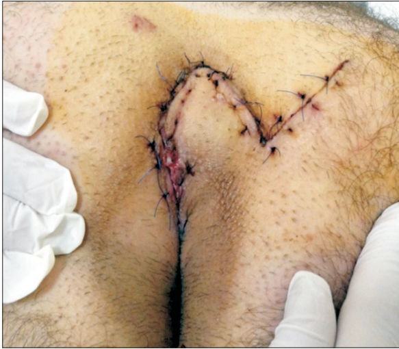
Fig. 1. Maceration due to mattress sutures.

between the needle entry points, in our daily practice. Intermittent mattress sutures might be a possible cause for maceration. Microorganisms may intrude easily through openings and, along with hairs, can cause early recurrences. Reducing the number of entry points with continuous subcuticular closure may be the solution to this condition.