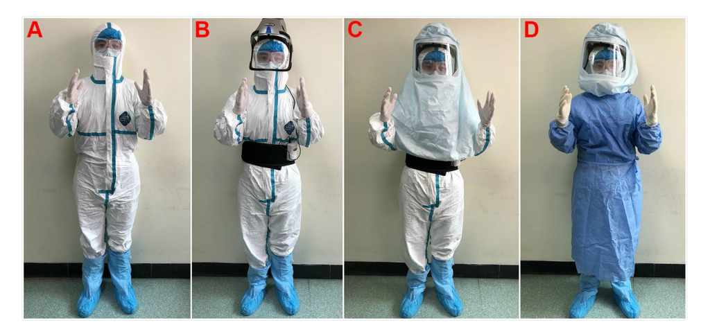
Figure 2 Participant's process of donning personal protective equipment. Two layers of personal protective equipment combined with powered air-purifying respirator (PAPR) (A): the protective cover-all with hood- Inner layer personal protective equipment, (B) Wear a PAPR, (C and D): Outer personal protective equipment with a hood PAPR.