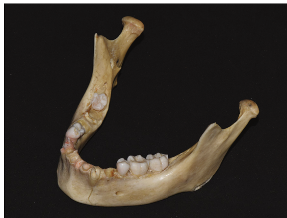
FIGURE 1: A dry human mandible without recent dental restoration.

2.2. Image Registration of Optical Dental Scan to CBCT Image. To merge the optical dental scan and the CBCT image, an image registration process was conducted in an