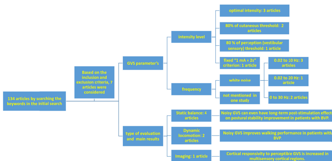
Fig. 1. Graphical abstract of the literature review.

A safe and independent movement depends on awareness of the environment features while maintaining the proper body orientation related to support surface and gravity (33). Integration of sensory inputs from visual, somatosensory, and vestibular systems is needed for postural control (34). Balance information, including vestibular, somatosensory and visual inputs, and motor commands, are simultaneously processed and integrated through a central processor, the "vestibular nucleus complex." Although balance control and walking are controlled by many structures in the brain, the vestibular system plays a special role. One of its roles is the detection of the head orientation related to the gravity axis, which is 4 to 5 times more accurate than the vision. This subtle detection of head orientation leads to a proper adaptation to gravity and the prevention of imbalance and falls (35). Since vestibular nucleus sends motor commands to the eyes and the body, timely and directed signals are required to the vestibular reflexes effectors, that is, skeletal and extraocular muscles and extensive communication between the vestibular nucleus complex, cerebellum, ocular motor nucleus, and the brainstem reticular formation sys-