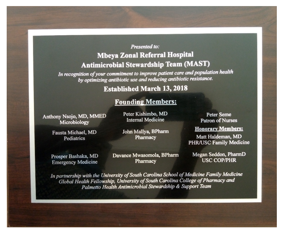
Figure 1. Mbeya Zonal Referral Hospital Antimicrobial Stewardship Team (MAST) established 13 March 2018.

Referral Hospital Antimicrobial Stewardship Team (MAST) (Figure 1). The UofSC global health fellow for the years of 2017–2019 focused efforts on developing this project. Teleconferences and video meetings were scheduled connecting the team from both institutions more frequently than travel allowed.