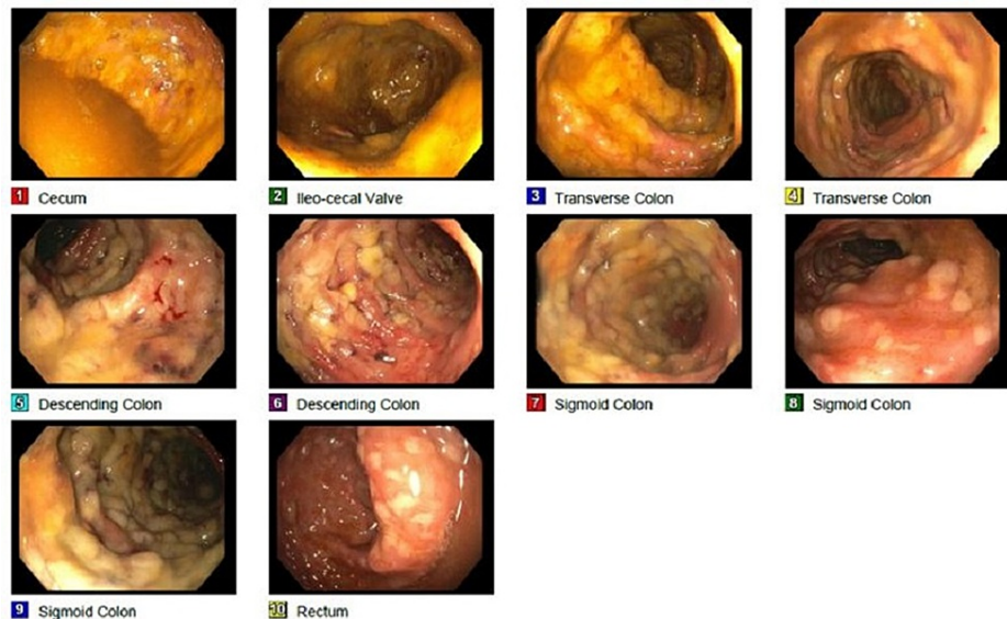
FIGURE 2: Colonoscopy demonstrating pseudomembranous colitis.

Perianal and digital rectal examinations were unremarkable. Diffuse and severe pseudomembranes with friability, erythematous, and inflammatory changes were seen in the entire colon, more prominent in the left colon. Continuous ulcerated areas covered with fibrinous exudate are seen best in images 6-10.