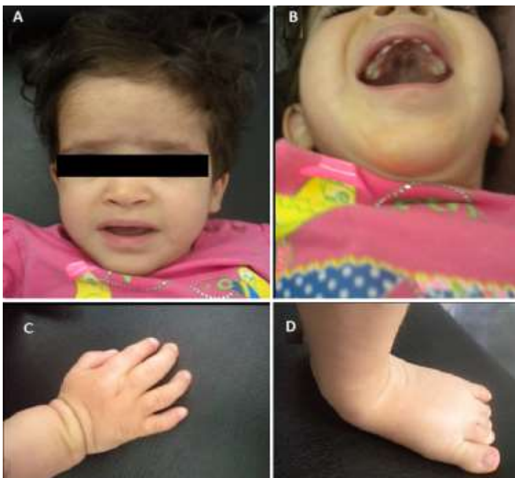
Figure 2: clinical characteristics of our patient: A) facial phenotype; B) ogival palate; C) brachydactyly and clinodactyly of the fifth finger; D) valgus