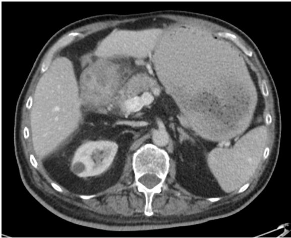
Fig. 1. Axial view of CT abdomen/pelvis with IV contrast demonstrating a bulky circumferential irregular thickening and enhancement of the gastric wall at the level of the pylorus involving the duodenal bulb. Additionally, there is a chronic ellipsoid pocket of fluid associated with the peritoneal lining posterior to the liver that was noted to represent an old abscess or hematoma cavity.