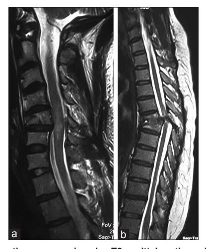
Figure 1: Magnetic resonance imaging T2-sagittal sections shows anterior wedge compression of C5 vertebra with cord contusion (a) and mid-dorsal fracture dislocation (b)

3 years in the Departments of Neurosurgery and Urology in Sher-i-Kashmir Institute of Medical Sciences, Kashmir. The patients with clinical features of myelo- or radiculo-pathy with computed tomography/magnetic resonance imaging evidence of compression of the spinal canal were included in the study. All age groups were included in this study. The patients having concomitant brain lesion, persisting spinal shock [Figure 1], active urinary tract infection, and bladder calculus, patients who could not be weaned off from indwelling urethral catheter were also excluded from the study. The study recruited 69 patients initially; however, only 63 patients reported on follow-up, and hence, only these 63 patients are discussed. The apparatus used for urodynamic study was fully automatic computerized urodynamic machine (MMS LIBRA + 3T, Netherland). Data were analyzed by MMS software version 7.3 (Mixed model analysis Software, Netherlands, Europe) t. All the patients were evaluated for neurological recovery as per the American Spinal Injury Association (ASIA) impairment scale before discharge.<sup>[6]</sup>