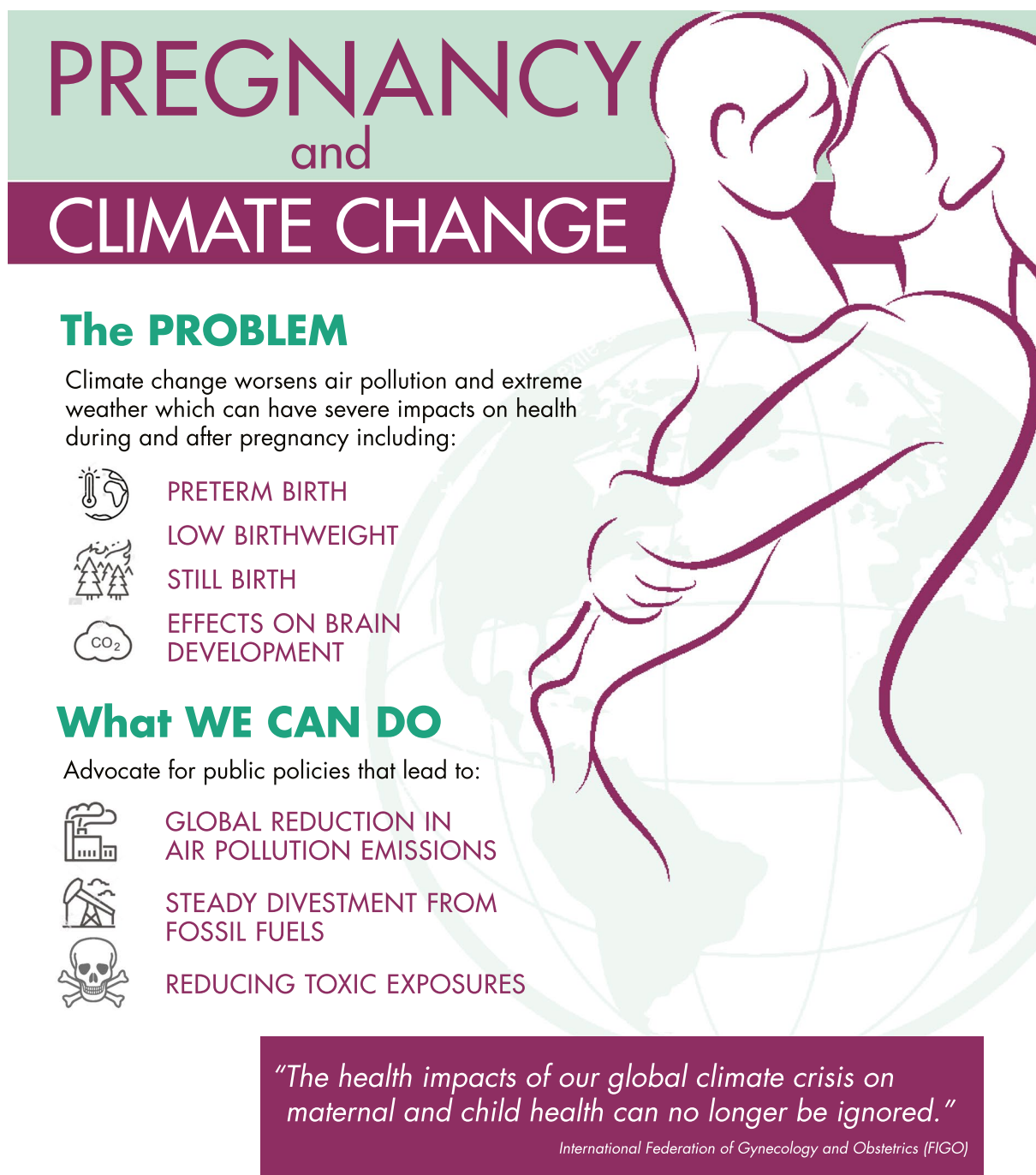
FIGURE 2 Infographic for health advocates and policymakers, giving an overview of the ways in which climate change increases health risks to pregnant women and their children. Available in nine languages: English, German, French, Spanish, Portuguese, Italian, Polish, Bosnian and Serbian https://www.env-health.org/climate-change-puts-pregnant-women-at-greater-risk-new-infographic-by-figo-ucsf-and-heal/ , Accessed September 27, 2021

will potentially cause societal fragmentation. This anti-environment activity has negative consequences that can ultimately impact the health and well-being of people. 99