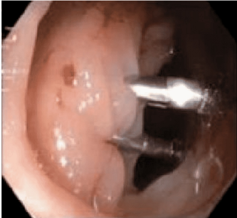
FIGURE 2: Two endoclips applied for the purpose of hemostasis.