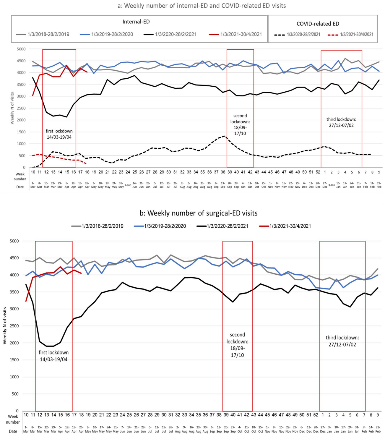
Fig. 1 Weekly number of ED visits, by year a Internal and COVID-related ED visits; b surgical ED visits 03/2108–02/2019; 03/2019–02/2020; 03/2020–02/2021; and March–April 2021

The US Centers for Disease Control and Prevention (CDC) reported a similar trend in the US, namely a steep decline in ED visits at the beginning of the pandemic which remained below pre-pandemic levels throughout 2020 [18].