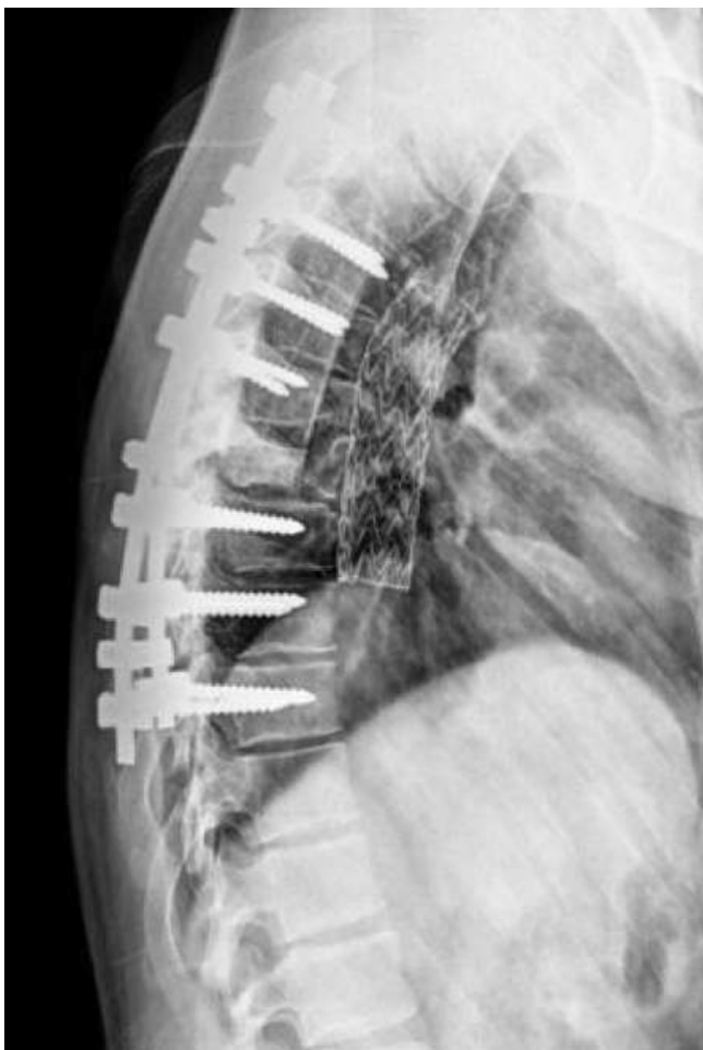
Fig. 3. Lateral X-ray projection at 6 months: no further dislodgment of fracture with satisfactory bony healing as well as absence of stent complications are seen.