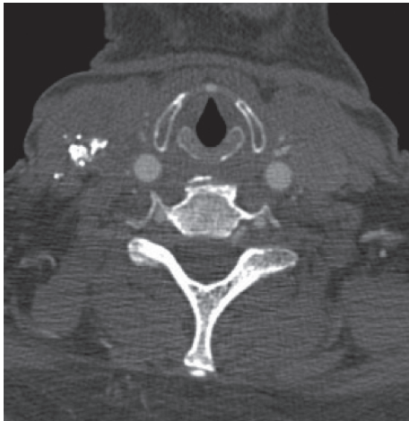
FIGURE 3: CT angiography neck: right neck mass on 1 month follow-up status after right pseudoaneurysm embolized with glue. These can be compared to the preintervention CT in Figure 1 showing that the neck mass has improved.

On follow-up one month later, the mass was no longer pulsatile but still present on physical exam. CTA of the neck showed a decrease in size from the previous CTA (Figure 3).