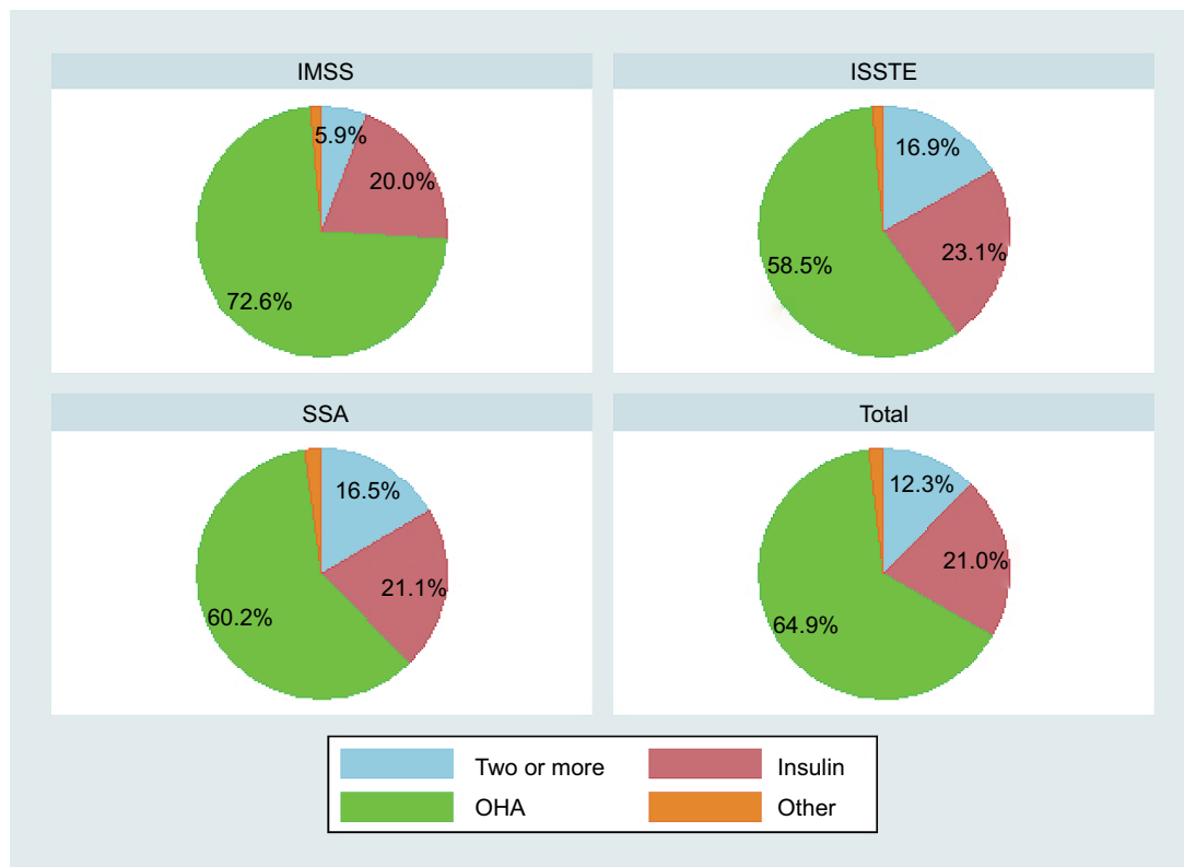
Figure 1 Distribution of prescribed medications by health care institution.

Abbreviations: IMSS, Instituto Mexicano del Seguro Social; ISSSTE, Instituto de Seguridad y Servicios Sociales de los Trabajadores del Estado; OHA, oral hypoglycemic agents; SSA, Secretaría de Salud.