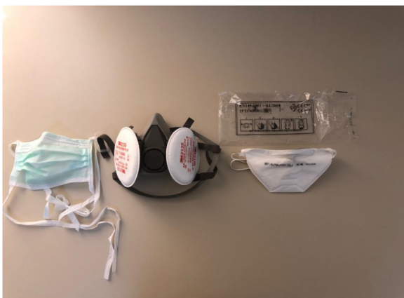
Figure 1. Protective masks used in the study.

After obtaining the permission of the ethics committee, 48 participants were recruited into the study. Participants were selected from among physicians and paramedics who received CPR training according to the latest American Heart Association guidelines. Participants were asked to perform CPR according to current guidelines on the CPR model (Ambu Man Manikin, Ambu Inc.; Columbia, MD) placed on the ground. The participants performed a total of five rounds of chest compressions, consisting of 2 min of chest compressions and a 2-min break, for 4 days, with a different mask at the same time of day and under the same physical conditions. In each separate condition, all participants performed chest compressions without any mask, with a surgical mask (three-layer surgical mask; Merve Medikal, İstanbul, Turkey), an FFR mask (FFP3; Foldap, Adana, Turkey), a half-face mask (6200; 3M, St. Paul, MN), and a mask with active P3 filter (2135; 3M) (Figure 1). Daily mask-type status was determined by the lot for each participant