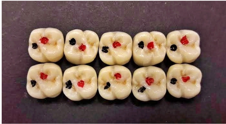
FIGURE 2: Monolithic high-translucency Y-TZP crowns (HTZ group)

Similarly, the metal dies were scanned to design and mill 10 fully anatomical high-translucency crowns for the HTZ group from a high-translucency zirconia blank (ZircoStar). One of the crowns from the PVZ group was scanned by the Smart Optical 3D scanner and used as a bio-copy to design the translucent monolithic zirconia crowns with a 30 \mu\text{m} spacer using Exocad software. The crowns were sintered in a furnace at 1,450° C to attain their full strength and glazed using Vita AKZENT Plus (VITA Zahnfabrik, Bad Säckingen, Germany) at glazing temperatures specified by manufacturer's instructions (Figure 2).