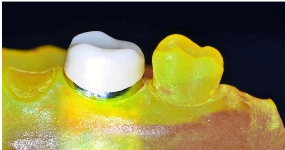
FIGURE 1: Zirconia coping on the metal die

The 10 copings were milled using pre-sintered Y-TZP materials (Zircostar®, Kerox Dental, Sósokút, Hungary) and the sintering procedure was followed to the manufacturer's specifications (Figure 1).