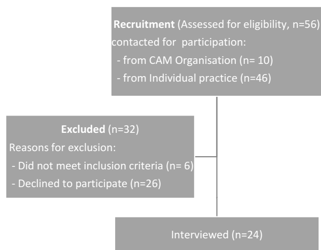
Figure 2 Flow chart of recruitment.

The participants were predominantly female ( n=18 , 75%), aged 31–60 years ( n=24 , 100%), with a mean age of 43 (SD 6.4) years. Participants spanned nine different CAM disciplines, with more than half (54%) being naturopaths, who worked across private practice, health food stores and pharmacies (Table 1).