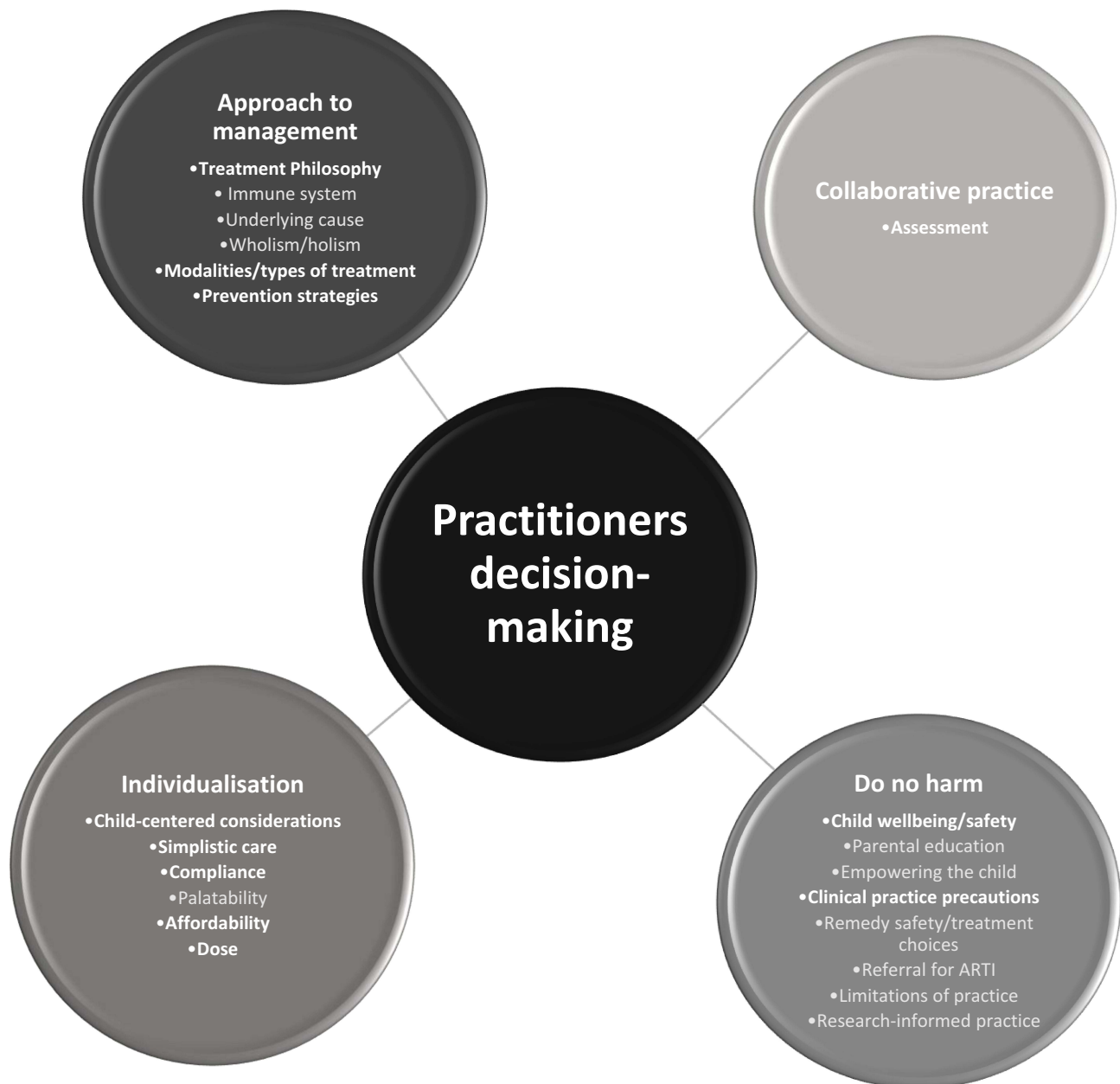
Figure 3 Diagrammatic overview of four key factors influencing practitioner decision-making regarding the management of ARTI in children.