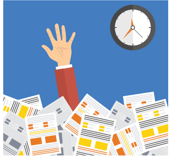
FIG. 3. With more than 1000 more new submissions for the first 6 months of 2020 as compared to the number in 2019, it is easy to understand how the Peer Review Department, the editors in chief, the associate editor, and members of the editorial board could be overwhelmed by the sheer number of new manuscript submissions. Figure is available in color online only.

most part to receive treatment. It is tempting to speculate that neurosurgeons who were unable to carry out their usual clinical duties were motivated to write new papers on their research, complete papers that had been started, or redirect papers to the journal if they had not been accepted elsewhere. On the whole, we are inspired by the notion that neurosurgeons would use the time provided by