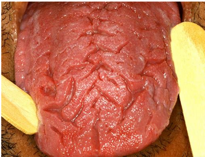
Fig. 2. Fissured tongue also observed in this case.