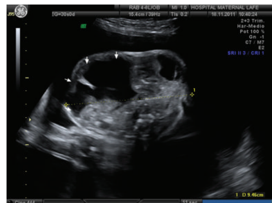
FIGURE 4: New ultrasound control in week 30, which maintains the increased tumor size (arrows) and heterogeneous component.

So we create a multidisciplinary EXIT team, to be able to make a safe surgery management. It was necessary the participation of Obstetrics, Neonatology, Children's and Adult Anesthesia, Children's Otolaryngology and Pediatric Surgery. After the case study, it is decided to finish pregnancy at 35 gestational week, with previous fetal lung maturation.