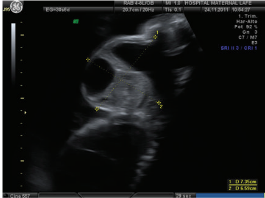
FIGURE 5: Lateral view of the last ultrasound control before surgery.