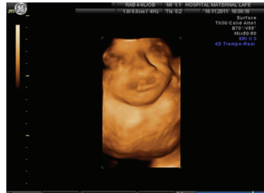
FIGURE 3: 3D ultrasound.