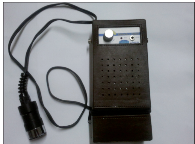
Figure 1. Sonar Doppler.

The statistical methodology used in this study consisted of descriptive analysis (average) and inferential statistics (significance test).