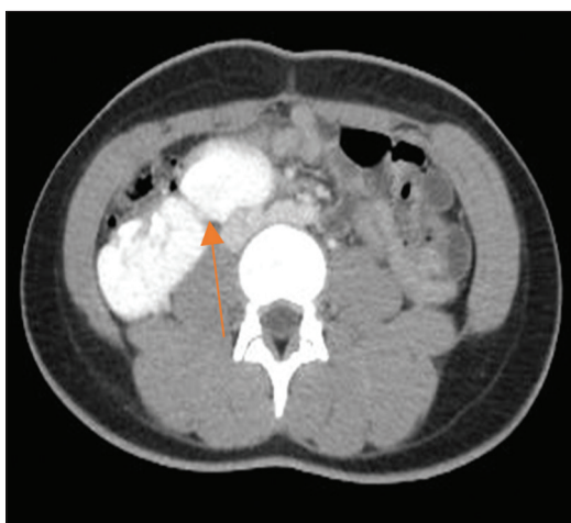
Figure 1: An axial image of the patient showing right fusion of the two kidneys

The development of the kidney begins in the 4 th week of intrauterine life by inductive interaction between the ureteric bud and the metanephric blastema. [5] Developmental anomalies can occur due to errors in the development, migration, and rotation of the kidneys. Although the exact cause of CFRE is not known, it is believed that the abnormal development of the ureteric bud and metanephric blastema during the 4 th –8 th week of gestation may be responsible. [1] In addition, the time and amount of fusion as well as the extent of rotation determine the final shape and location of the kidneys. [6] CFRE is the second most commonly observed renal fusion anomaly after horseshoe kidney. [2]