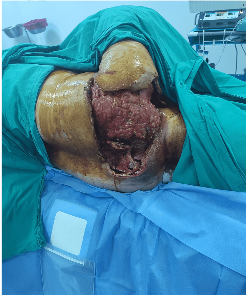
FIGURE 3: Healthy granulation tissue in the defect site as a result of serial debridement.