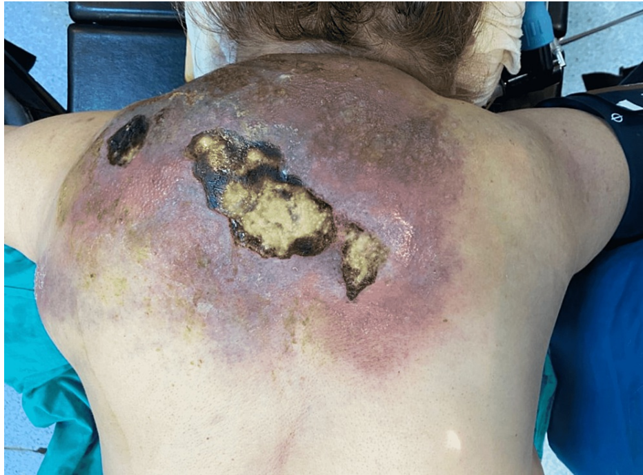
FIGURE 1: Massive abscess with zona rash and skin necrosis on the back.

On presentation, her blood pressure was 110/55 mmHg, and her heart rate was 113 beats per minute. In addition, the hemogram revealed neutrophil-based leukocytosis and thrombocytosis. She also had moderate creatinine elevation compatible with acute renal failure. C-reactive protein level was 250 mg/dL, sodium was 130 mg/dL, and glucose was 110 mg/dL. The patient was diagnosed with necrotizing fasciitis. Her Laboratory Risk Indicator for Necrotizing Fasciitis (LRINEC) score was 10 which shows a high risk for necrotizing fasciitis. The patient was taken to the operating room. Subcutaneous tissues were explored with the debridement of the necrotic skin. It was observed that the dense abscess extended under the trapezius muscle and caused necrosis in all subcutaneous soft tissues, including the muscle (Figure 2).