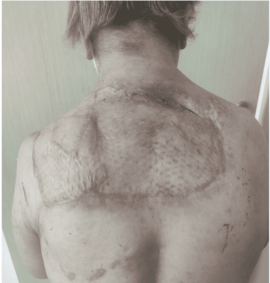
FIGURE 4: Tissue defects were skin grafted six months after discharge.