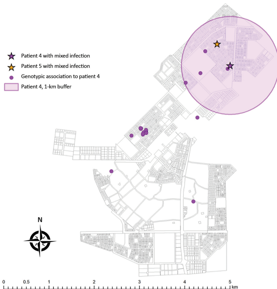
Figure 4. Potential spatial relationships (residence within 1 km of another patient) between mixed infection and other genotype-clustered cases, Ghanzi, Botswana, 2012–2016. Shown are locations of patients with mixed Mycobacterium tuberculosis infection and other genotype-clustered cases. Each color represents each genotype cluster. The 1-km radius blue-shaded area from each mixed infection patient shows the neighborhood boundary. Two patients with mixed infection were genotype-clustered and had a potential spatial relationship. (Their mycobacterial interspersed repetitive unit–variable-number tandem-repeat results were not exactly matched.)

Similarly, our findings suggest that most mixed infection transmission events included reactivation of remotely acquired strains triggered by recently acquired strains, implying that mixed infection may be affected by the force of infection in communities (10,11). We estimated the prevalence of each discrete MIRU-VNTR result as a proxy measure of force of infection in our study population. Contrary to our expectation, the 2 most prevalent strains (MIRU IDs 644 and 382) appeared in only 1 mixed infection transmission event. The dominate strain in the mixed infection was MIRU ID 838, which appeared 3 times. Further studies can show whether less transmissible strains outcompete other strains within the host to establish long-term persistence (11).