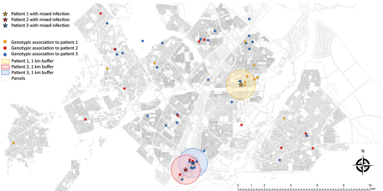
Figure 3. Potential spatial relationships (residence within 1 km of another patient) between patients with mixed-strain infection and with other genotype-clustered strains, Gaborone, Botswana, 2012–2016. Shown are location of patients with mixed Mycobacterium tuberculosis infection and other genotype-clustered cases in Gaborone. Each color represents each genotype cluster. The 1-km radius blue-shaded area from each mixed-infection patient shows the neighborhood boundary. Three patients with mixed infection had potential spatial relationships with 3–6 other patients within the neighborhood.

might further compromise the immune system, leading to reactivation. A previous case study described a patient with mixed infection with an apparent triggering of a remote multidrug-resistant M. tuberculosis strain after recent exposure to a drug-sensitive strain (16). A similar phenomenon has been described for relapse of Plasmodium vivax malaria triggered by infection with P. falciparum (17).