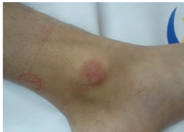
Figure 1. The Skin Lesions Were Present on Both the Legs and Were Tender, Erythematous, and Predominantly Nodular in Shape, Without Any Discharge (Before Treatment)

The results of the laboratory tests were as follows: WBC count, 4,500 \times 10^6 / lit (neutrophils: 39%, lymphocytes: 55%, and others: 6%); hypochromic microcytic anemia (hemoglobin: 10.3 g/dL, MCV: 71); platelets, 174,000/\mu\text{L} ; erythrocyte sedimentation rate, 24; creatinine level, 0.9 mg/dL; total bilirubin, 1.6 mg/dL and direct bilirubin, 0.4 mg/dL; serum aspartate aminotransferase (AST) level, 348 IU/L (normal level, up to 40 IU/L); alanine aminotransferase (ALT) level, 555 IU/L (normal level, up to 40 IU/L), alkaline phosphatase (ALP) level, 395 IU/L (normal level, up to 1800 IU/L in pediatric patients); and lactate dehydrogenase (LDH) level, 612 IU/L (normal level, up to 450 IU/L). The results of hemostatic screening tests (for the prothrombin time and international normalized ratio) were normal. Serum protein electrophoresis showed total protein level of 6.9 g/dL (normal range, 6.0–8.4 g/dL), albumin level of 3.6 g/dL (normal range, 3.5–5.0 g/dL), and globulin level of 2.97 g/dL (normal range, 2.3–3.5 g/dL). Her blood samples were not positive for HBs antigen,