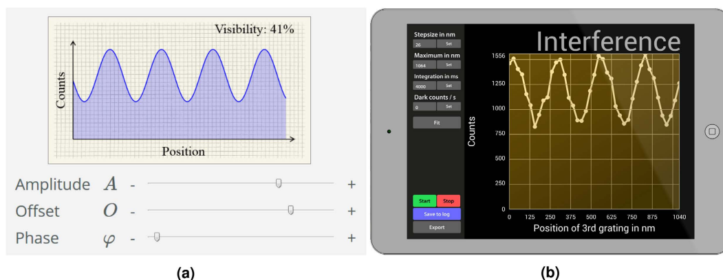
Figure 2. Multiple representations of science in SiReX LE. (a) Interactive illustrations in the SiReX Knowledge Base visualize the mathematical background and concepts of molecular matter-wave experiments. They are limited to a handful of parameters and are free of noise. (b) In the SiReX Laboratory students can control a wide range of parameters on a virtual tablet to conduct experiments with realistic noise and restrictions of the real-world setup.

to be understood by undergraduate students. SiReXs shall guide students through a complex modern infrastructure and in passing teach a comprehensive set of subjects, here from thermodynamics over mass spectrometry, to advanced elements of optics and quantum optics. This approach should reveal the interconnectedness of different concepts of experimental physics and allow training students in applying their knowledge in a real-world environment. This multi-topic approach differs from many earlier interactive learning tools for quantum physics 16–18 that refer to one specific concept or phenomenon.