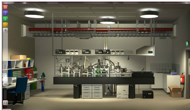
Figure 1. The SiReX Laboratory: A photo-realistic 3D representation of an existing laboratory allows to explore molecular quantum optics.