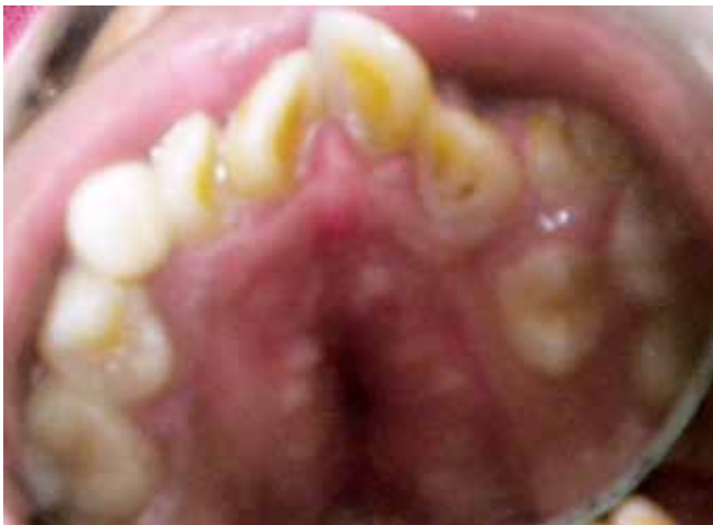
Fig. 4: Pseudocleft