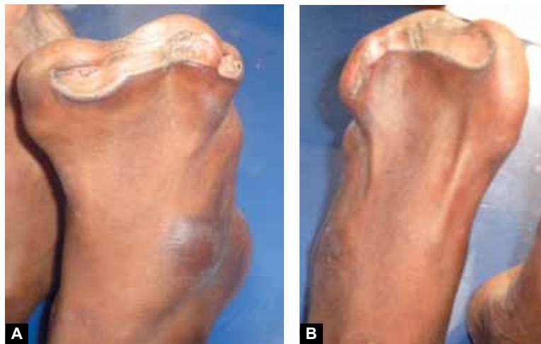
Figs 3A and B: (A) Syndactyly of right foot and (B) syndactyly of left foot