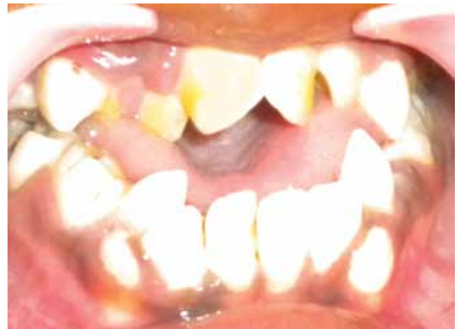
Fig. 5: Intraoral view

The intraoral features include high-arched palate associated with lateral swellings of the palatine processes on either side of the midline mimicking a 'pseudocleft' (Fig. 4). The oral hygiene was poor with abundant dental plaque and calculus. The gingiva showed congestion and inflammatory enlargement in relation to anterior teeth with several decayed teeth. Angle's pseudo class III malocclusion with severe