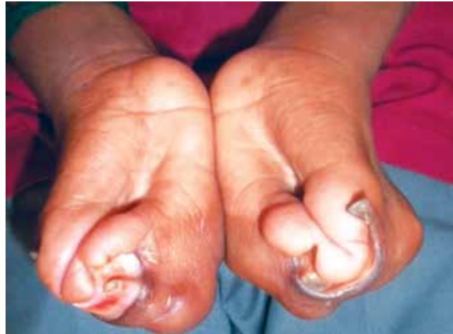
Fig. 2: Syndactyly of hands