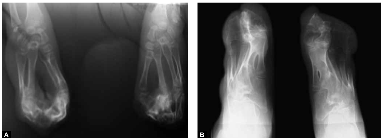
Figs 6A and B: (A) Radiographs of hand and (B) radiographs of feet