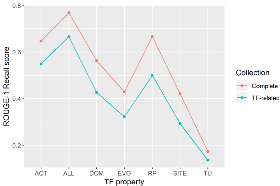
Figure 4. ROUGE-1 recalls scores obtained by automatic summaries without stop words for all properties (ALL) and for each property. Automatic summaries were created using the complete article collection (Complete) and using only TF-related articles (TF-related).