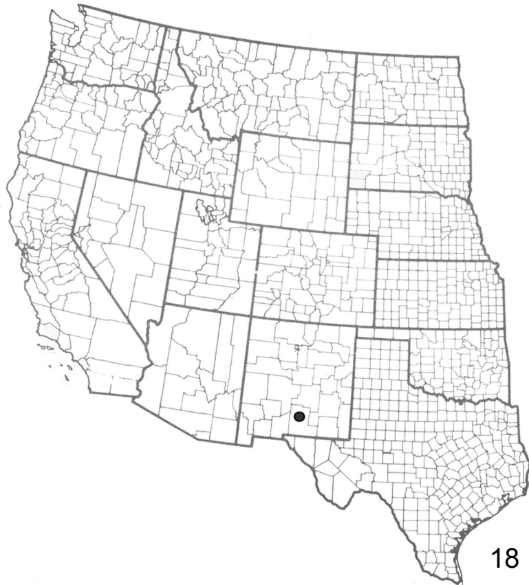
Figures 17–18. Aleptina arenaria habitat and distribution map. 17 White dunes habitat of type locality of A. arenaria 18 Distribution map for A. arenaria .