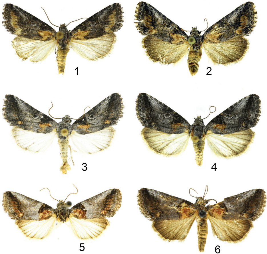
Figures 1–6. Aleptina adults. 1 A. arenaria Metzler & Forbes, male holotype 2 A. arenaria Metzler & Forbes, female paratype 3 A. inca Dyar, male 4 A. inca Dyar, female 5 A. clinopetes Dyar, male 6 A. clinopetes Dyar, female.

106°10.84'W, 32°46.64'N 4,008', 12 Sept. 2010 WSNMF, Eric H. Metzler, uv tr[a]p, Accss #: WHSA – 00131. WSNM, interdune habitat, 106°11.38'W, 32°46.69'N 4,000', 11 June 2010 WSNM8, Eric H. Metzler, uv tr[a]p, Accss #: WHSA - 00131. WSNM, interdune habitat, 106°11.32'W, 32°45.72'N 4,000', 22 July 2008 WSNM9, Eric H. Metzler, uv tr[a]p, Accss #: WHSA - 00131. WSNM, interdune habitat, 106°11.32'W, 32°45.72'N 4,000', 17 May 2010 WSNM9, Eric H. Metzler, uv tr[a]p, Accss #: WHSA - 00131. WSNM, interdune habitat, 106°10.84'W, 32°46.64'N 4,008', 14 Sept 2009 WsnmF, Eric H. Metzler, uv tr[a]p, Accss #: WHSA - 00131. WSNM, interdune habitat, 106°10.82'W, 32°46.62'N 4,008', 15 July 2009 WSNMD, Eric H. Metzler, uv tr[a]p, Accss #: WHSA - 00131. Paratypes are deposited with UNM, MSU and EHM.