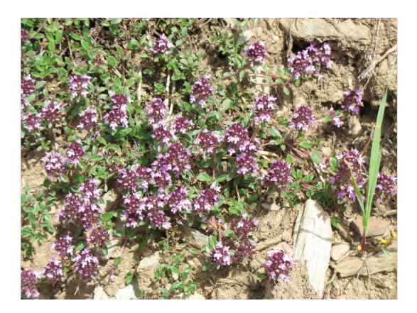
FIGURE 2: Thymus serpyllum L.

of pathogenic microorganisms has led to extensive phytochemical and pharmacological studies of T. serpyllum as an important source of medicinal substances with antioxidant, antimicrobial, antitumor, and cytotoxic properties and their effective medicinal application, as well as use in pharmaceutical, food, and cosmetic industries. In addition, the increased pressure from consumers for natural products as supplements and their clinical application instead of synthetic chemicals, which are generally perceived by the public as being more toxic, has also stimulated research into many medicinal and aromatic plants of which T. serpyllum occupies a very important place.