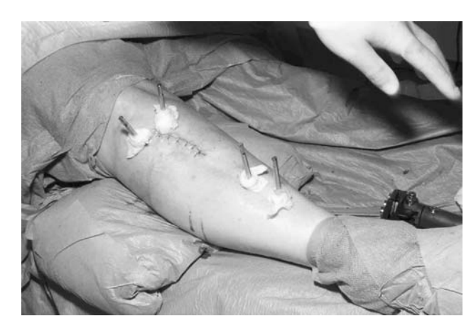
Fig. 1 Sterile compresses moistened with chlorhexidine 5 mg/mL in alcohol (ethanol 70%) as theatre dressing

70%) placed at each pin site, and fixed by a bandage (Fig. 1). The instructions are to leave the theatre dressing undisturbed during the first postoperative week except in cases of major leakage or suspicion of infection. In the first place the bandages should be strengthened (Fig. 2).