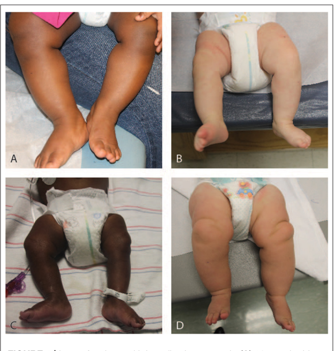
FIGURE 1 | Legs of patients with lateralized overgrowth. (A) 12-month old patient with Beckwith-Wiedemann syndrome. (B) 3-month old patient with Beckwith-Wiedemann syndrome. (C) 9-month old patient with Beckwith-Wiedemann syndrome. (D) 6-month old patient with PIK3CA-related overgrowth spectrum.

Patients with isolated lateralized overgrowth (ILO), those affected by LO but lacking other features and patterns of malformations, dysplasia, and morphologic variants, have been reported to have an increased development of tumors, primarily the embryonal tumors Wilms tumor (WT) and hepatoblastoma (HB) (2, 3), similar to the most common tumor types observed among patients affected by LO and overgrowth disorders (4). A prior study of patients with isolated hemihypertrophy, now referred to as ILO, reported 9 out of 168 developing a tumor (5) and two cases of HB in patients with isolated hemihyperplasia, now also termed ILO (6). Retrospectively, it is likely that many of these patients could be classified with an overgrowth or cancer predisposition syndrome.