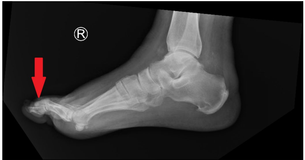
FIGURE 2: Lateral view of right foot illustrating a soft tissue swelling at the tip of the third toe.

Initial laboratory studies indicated a white blood cell (WBC) count of 10.4 cells/ \mu L (normal 3.5-10.6 cells/ \mu L), differentials (neutrophils 2.7; lymphocytes 1.3; atypical lymphocytes 0.7; monocytes 4.8; eosinophils 0.1), a hemoglobin of 11.5 gm/dL (normal 13.3-17.1), a platelet count of 124 \times 10^3/\mu L, C-reactive protein (CRP) of 139.9 mg/L (normal less than 10), and erythrocyte sedimentation rate (ESR) of 86 mm/hr (normal 1-13 mm/hr). Biochemical studies indicated glucose 183 mg/dL (normal 70-110), blood urea nitrogen (BUN) 21 mg/dL (normal 7-20), and creatinine 1.96 mg/dL (normal 0.70-1.30). Blood cultures were obtained on his first day of admission and indicated no growth after five days. Podiatric surgery was consulted, and a plan for surgery was made with the recommendation to hold antibiotics until after the operating room (OR).