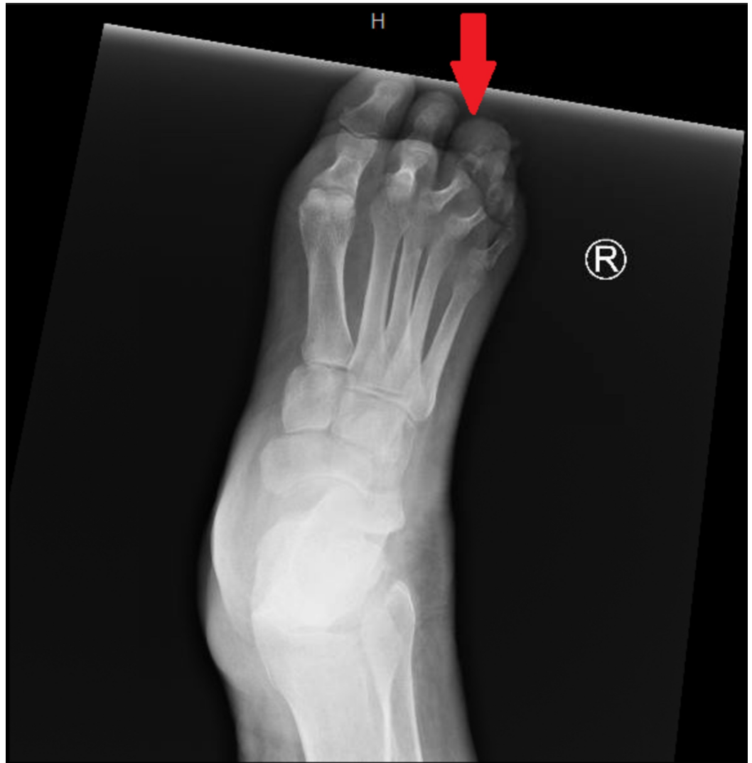
FIGURE 1: Anterior-posterior view of right foot illustrating a soft tissue swelling at the tip of the third toe.

pulse oximetry reading of 97% on room air. On physical exam, the heart and lungs exam was unremarkable, and his abdomen was soft and non-tender with no appreciable organomegaly. Cervical lymph nodes were not enlarged on the initial examination. Bilateral dorsalis pedis pulses were identified utilizing Doppler. The patient was found to have a non-tender third toe with purple/black discoloration. The toe was swollen and fluctuant with a distal wound that probed to the bone. Epicritic and gross sensations were diminished in both feet bilaterally. An X-ray was obtained, which illustrated that the tip of the distal phalanx of the third toe is missing. There was also soft tissue injury to the tip of the third toe (Figures 1, 2).