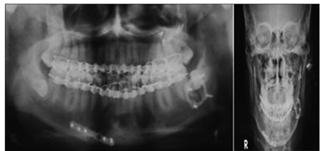
Figure 2: Post operative check X-rays