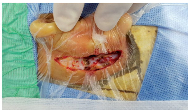
Fig. 2. Draping and skin incision for nonshaved ear surgery. Skin incision was done through a transparent adhesive drape, which was placed over the skin to be incised.

standardized technique. Cultures were obtained with a standard cotton-tipped culture swab. In both groups, each culture swab was swabbed over expected skin incision area for 1 to 2 seconds after the painting and draping and transported in an aerobic or anaerobic transport media tube.