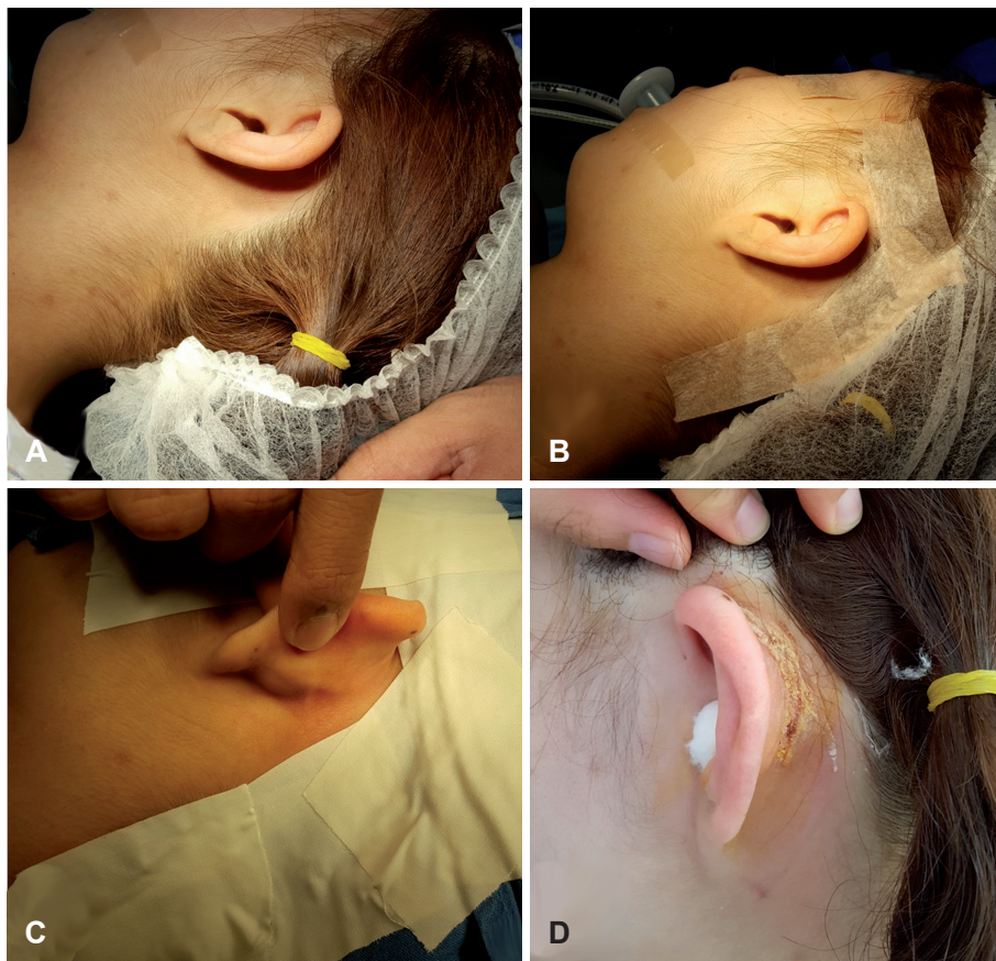
Fig. 1. 17 year-old female. A-C: Preparation of nonshaved ear for postauricular tympanoplasty. D: 1st postoperative day.