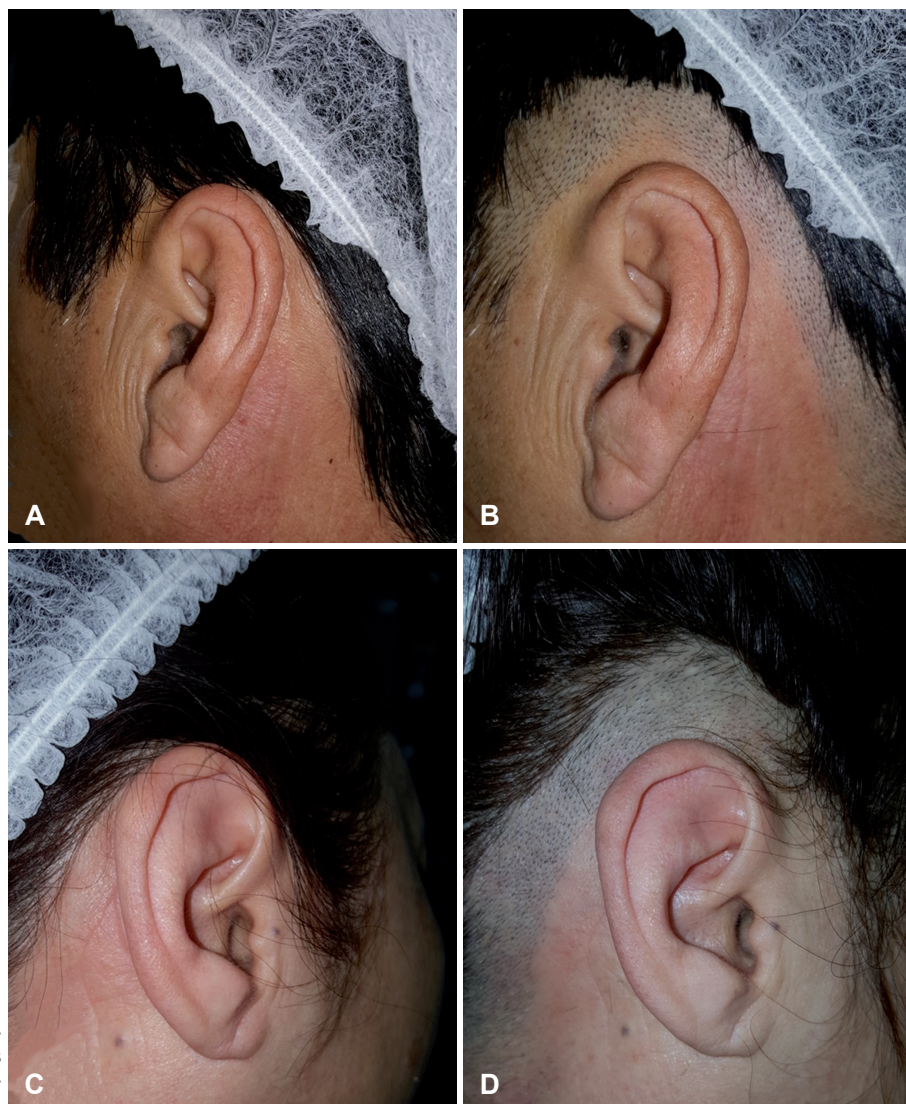
Fig. 4. Two sample photos of shaved ear for the middle ear and mastoid surgery. Images of before (A) and after (B) hair shaving in a man. Images of before (C) and after (D) hair shaving in a woman.

SSI and the other organ/space SSI. The limitation of this study was vague clinical definition of the latter organ/space SSI. Bastier, et al. [13] pointed out the same problems as we did. If the infected discharge from deep portion underneath the postauricular incision, deep incisional and organ/space SSI may be not easily differentiated because of possible mastoid-subcutaneous fistula, especially in the tympanomastoidectomy cases. It is also difficult to specify the origin of purulent postoperative otorrhea because it may be due to infection either of the ear canal incision (incisional SSI) or of the graft or middle ear (organ/space SSI).