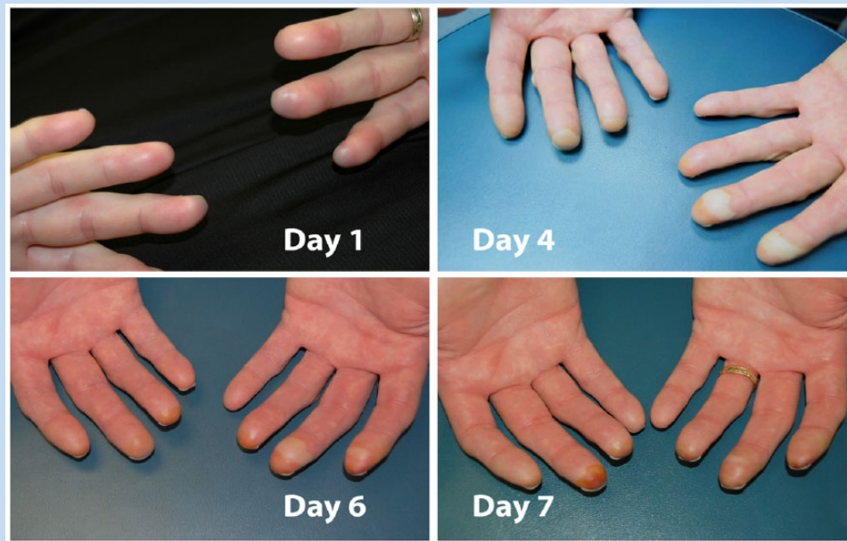
Figure 2. Progression of second-degree frostbite injury from contact with fuel-soaked gloves at a wind-chill temperature of -10.3^{\circ}\text{F} . The injury was treated with rapid rewarming in a warm water bath, dry loose bandages, and pain medications.

recommended. 17 With studies suggesting much worse injury in thaw-refreeze injuries, the injured tissue should not be rewarmed until that athlete is in an environment with minimal risk of refreezing. Initial warming can be done using the athlete's or first responder's own body heat. 18 Areas like the axilla tend to be the warmest. Care should be taken not to put yourself or others at risk for injury. Ideally, frostbite should be treated at a medical clinic or local medical facility where rapid rewarming and further assessment and treatment can be done. Rapid rewarming should be done in a warm-water bath at 37^{\circ}\text{C} to 39^{\circ}\text{C} ( 98.6^{\circ}\text{F} - 102.2^{\circ}\text{F} ). 16,17 Spontaneous thawing of skin tissue should be allowed if rapid rewarming cannot be done. Avoid using fires or stoves to warm injured digits to prevent burn injuries. 17 Warming of the injured tissue should be continued until the skin is red or purple in color and soft to touch. 17 Rewarming can be painful and medications may be needed. Blisters should be left intact and may be covered with dry, loose bandages. Avoid circumferential bandages if possible to allow for swelling of the injured tissue. 17 Antibiotics are not indicated unless complications of infection develop. Medical evaluation at a hospital should occur as soon as possible to further assess depth of injury and consider higher levels of treatment (Figure 2).