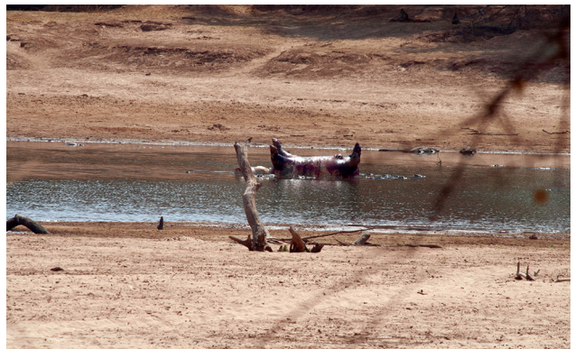
Figure 4. A dead hippopotamus floating down the South Luangwa River in northeastern Zambia during an anthrax outbreak in 2011.

The second part of the investigation involved going into the field to view 3 of the areas where most of the infected hippopotamuses were found. The site visits occurred within about a month after the outbreak and were conducted to better understand the topography and the range of the animals and to identify any additional animal species affected by anthrax. All sites were areas frequented by the exposed human populations and were < 1 km from residents' homes. The site surveys were not exhaustive; they focused on areas with known human-animal interaction (Figure 3) and recently discovered dead hippopotamuses (Figure 4). N95 masks, Tyvek suits, and rubber boots were worn