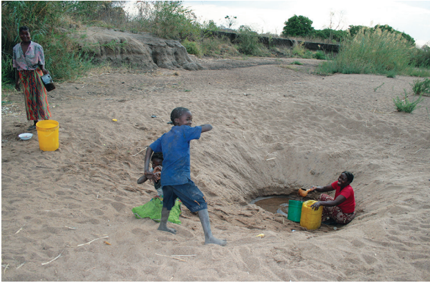
Figure 2. A family searching for water by digging deep into a dried riverbed during the dry season in northeastern Zambia.

These villages' estimated combined population of adults \geq 15 years of age is 6,553 (12). A questionnaire (online Technical Appendix, https://wwwnc.cdc.gov/EID/article/23/9/16-1597-Techapp1.pdf ) was developed in English and translated into Senga, the local language spoken in these areas. The questionnaire was designed to complement and expand on the data initially collected in the district by local public health officials. It captured age, sex, and occupation and yes/no responses to several questions about symptoms, exposure to hippopotamuses, food sources, and whether respondents would eat meat from an animal they found dead. Those who responded that they would eat animals they found dead were asked an open-ended question to elucidate their reasons for doing so. Interviewers and supervisors were trained on procedures for conducting the survey before fieldwork commenced. Interviewers and supervisors tested questions on each other, which resulted in improvements to question wording. They also practiced administering the survey on one another before interviewing community participants.