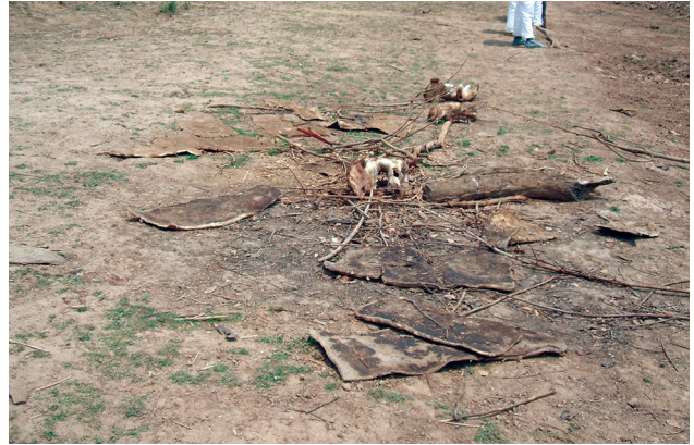
Figure 3. Hippopotamus bones and hides left behind after butchering of animals that were found dead on a river bank and later identified as the source of anthrax causing an outbreak among humans in northeastern Zambia, 2011.

Three teams administered the questionnaire, each team made up of a trained District Health Office staff supervisor and 6 trained volunteer interviewers. Each team was assigned to 1 of the 3 communities. Interviewers selected every fifth household they encountered in each village for inclusion and interviewed all adults \geq 15 years of age living in selected households. No incentives were offered for participation. Interviewers read each prospective participant a description of the survey, highlighting that it was voluntary and could be stopped at any time by request. The Zambia Ministry of Health deemed this outbreak investigation to be exempt from Research Ethics Committee review. The investigation protocol was reviewed by the CDC-Zambia office and CDC's National Center for Emerging and Zoonotic Infectious Diseases, in accordance with institutional review policies. The protocol was determined to be non-research under 45 CFR 46 §102(d) and therefore did not require Institutional Review Board review.