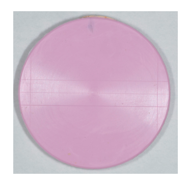
Figure 1. Vinyl polysiloxane (VPS) sample.

The samples (n = 10) of the silicone (Imprint<sup>TM</sup> 4 Preliminary Penta<sup>TM</sup> Super Quick, 3M ESPE<sup>TM</sup>, St Paul, MN, USA, Lot 545318) (Figure 1) were obtained according to International Organization for Standardization (ISO) 4823:2000, that specifies the use of a test block (Figure 2) [19]. The blocks were previously washed with deionized water in an ultrasound machine for two cycles and then placed in an oven at 37 °C for 15 min. After that, the material was obtained using an automatic mixer (Pentamix 2, 3M ESPE<sup>TM</sup>, Seefeld, Germany) in accordance with the manufacturer's instructions. The mixture was dispensed into the block assembly and covered with a rigid metal plate, protected with a polyethylene sheet. A two-kilogram weight was placed above the metal plate to ensure firm sealing of the material inside the block test. The entire assembly was immersed in a water bath at 35 °C to mimic the temperature of the oral cavity. After the manufacture recommended setting time of one minute and thirty seconds, the samples were removed from the bath, separated from the test block, washed, dried with blown air and labelled.