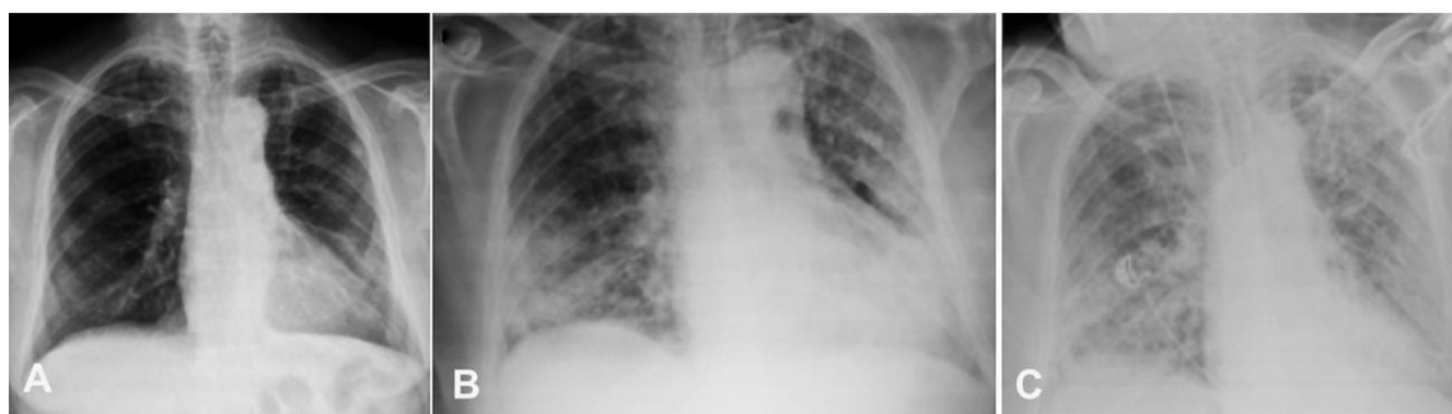
Figure 1. Postero-Anterior Chest X-ray depicting – A – bilateral poorly defined airspace opacities, with peripheral and lower zone predominance. Additional findings: Scarring at the lung apices, with volume loss and fibrosis due to previous tuberculosis; B – 4 days later. Radiological worsening, with a greater extension of the ground glass opacities and presence of peripheral consolidations, commonly reported imaging features of COVID-19 pneumonia; C – 6 days later, extensive coalescent opacities, with bilateral consolidation and panlobar involvement, typical radiological findings of ARDS.

Aminergic support was required for the first 4 days, during which he kept fever, sustained elevation of leukocytes count, CRP, and procalcitonin levels. Azithromycin was then administered along with the supra cited therapy. Blood cultures and secretions were sterile since admission. Due to the maintenance of low PaO 2 /FiO 2 , 40mg of IV methylprednisolone were