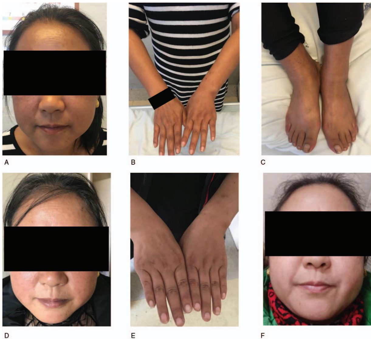
Figure 1. (A), (B), (C) Hyperpigmentation especially on the face, upper limbs as well as lower extremities; (D), (E) 1 month after the therapy; (F) 3 months after therapy.

Her laboratory data revealed overt hyperthyroidism: total thyroxine ( TT_4 )=284.28nmol/L (reference range, 58.1–140.6nmol/L), total triiodothyronine ( TT_3 )=12.26nmol/L (reference range, 0.89–2.44nmol/L), free thyroxine ( FT_4 )=58.11pmol/L (reference range, 9.01–19.05pmol/L), free triiodothyronine ( FT_3 )>46.08pmol/L (reference range, 2.63–5.70pmol/L), TSH <0.01mIU/mL (reference range, 0.35–4.94mIU/mL), anti-thyroglobulin antibody (TGAb)=10.82IU/mL (reference range, <4.11IU/mL), anti-TSH receptor antibody (TRAb)>40IU/L (reference range, <1.75IU/L), and anti-thyroid peroxidase antibody (TPOAb)=10.54IU/mL (reference range, <5.61IU/mL). The levels of cortisol (8AM-4PM-0AM) were 325.98nmol/L-150.83nmol/L-20.47nmol/L (reference range for 8AM is 185–624nmol/L), while adrenocorticotrophic hormone (ACTH) (8AM-4PM-0AM) were 69pg/mL-43pg/mL-9.8pg/mL (reference range for 8AM is 7.2–63.3pg/mL) and serum ferritin was 45.10 \mu g/L (reference range, 11.1 \mu g/L–306.8 \mu g/L). And the result of 1mg overnight dexamethasone screening test was negative (cortisol at 8AM the next morning was 11.71nmol/L).