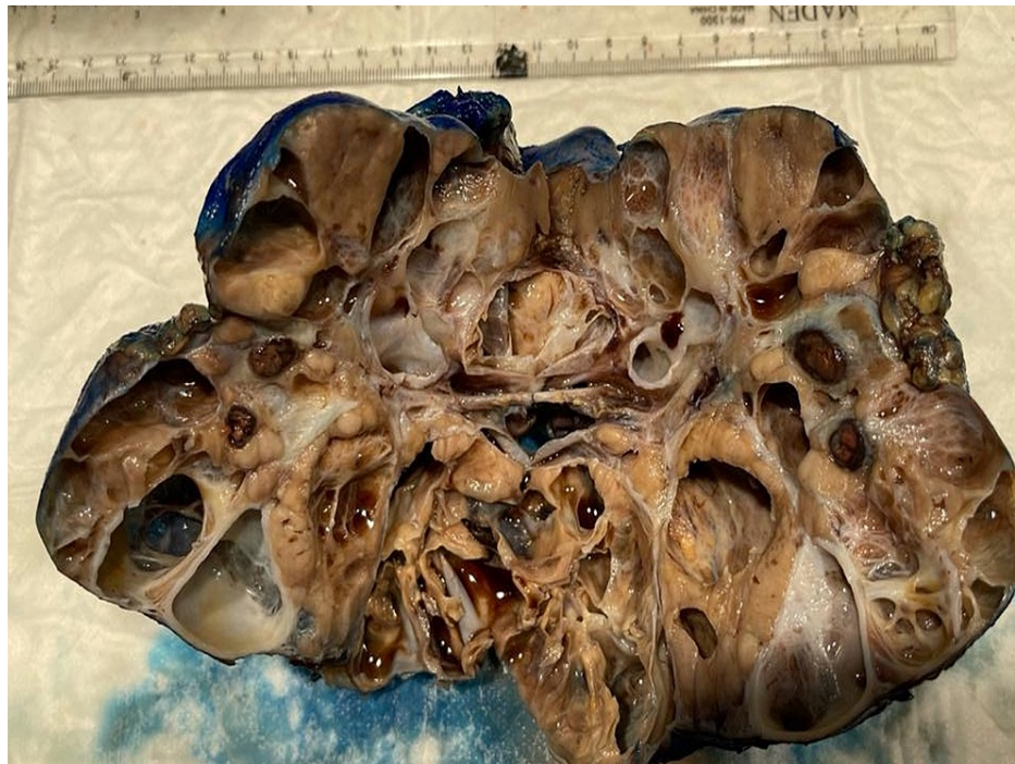
FIGURE 5: Gross image post radical right kidney nephrectomy showing large multilocular cystic renal cell carcinoma