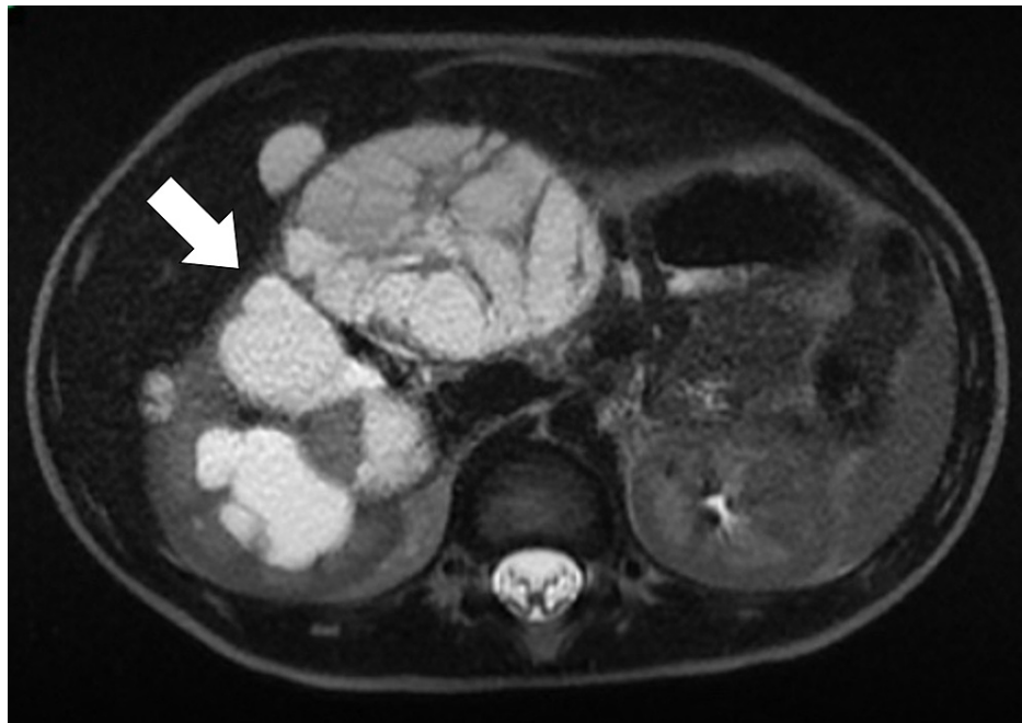
FIGURE 4: Axial T2 weighted MRI image demonstrates a well-circumscribed, encapsulated mass consisting of multiple cysts with variably enhancing septa soft tissue without vascular or adjacent organ invasion

Initially, an image-guided biopsy was performed; however, due to sample inadequacy, no diagnosis could be reached. The medical team decided to take the patient for an open incisional biopsy to include both the cystic and solid components in the biopsy. A frozen section by open surgical biopsy was not conclusive, and the pathologist required a permanent section to determine prior to performing a nephrectomy. After confirming the neoplastic nature of the renal cystic mass, the patient was taken for right nephrectomy through a right supra-umbilical transverse incision. Complete gross excision was achieved with no intraoperative or postoperative complication (Figure 5). As a result, a tumor board discussion was made and indicated no need for chemotherapy, radiotherapy, or any adjuvant therapies during the treatment course period.