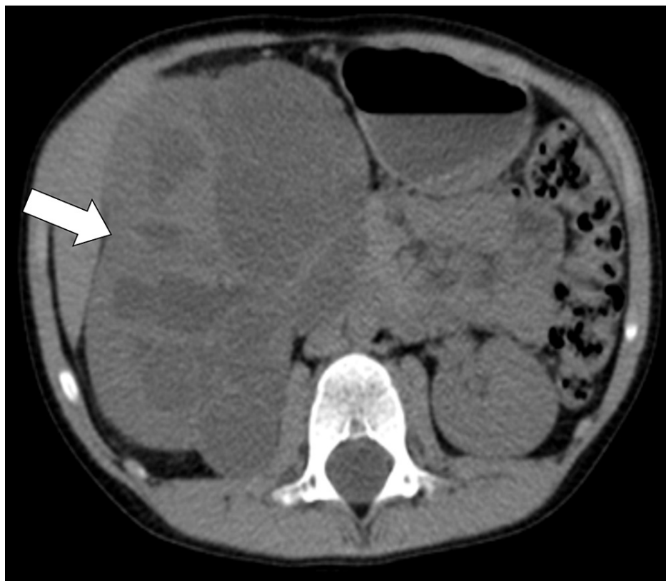
FIGURE 2: Axial non-enhanced CT scan showing multiloculated well defined soft tissue lesion arising from the right kidney measuring 11x8x7.5 cm (arrow)