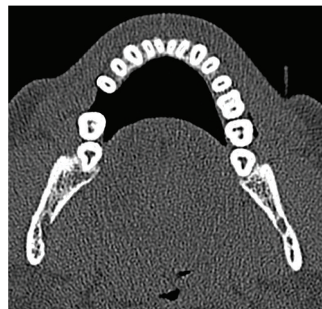
FIGURE 2: C-shaped canal in mandibular left second molar.