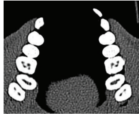
FIGURE 1: Axial view demonstrating MB2 in maxillary right first molar.

There were 5 cases in which multiple MB2 canals were present in maxillary molars and one case having multiple distolingual canals. In one of our case there were 5 canals in right maxillary first molar and 6 canals in left maxillary first molar (Figure 4). Also in the same patient, four canals were seen in right and left mandibular molars.