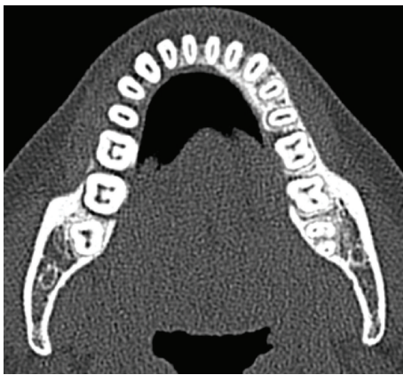
FIGURE 3: Axial view showing four canals in right first and second mandibular molars.