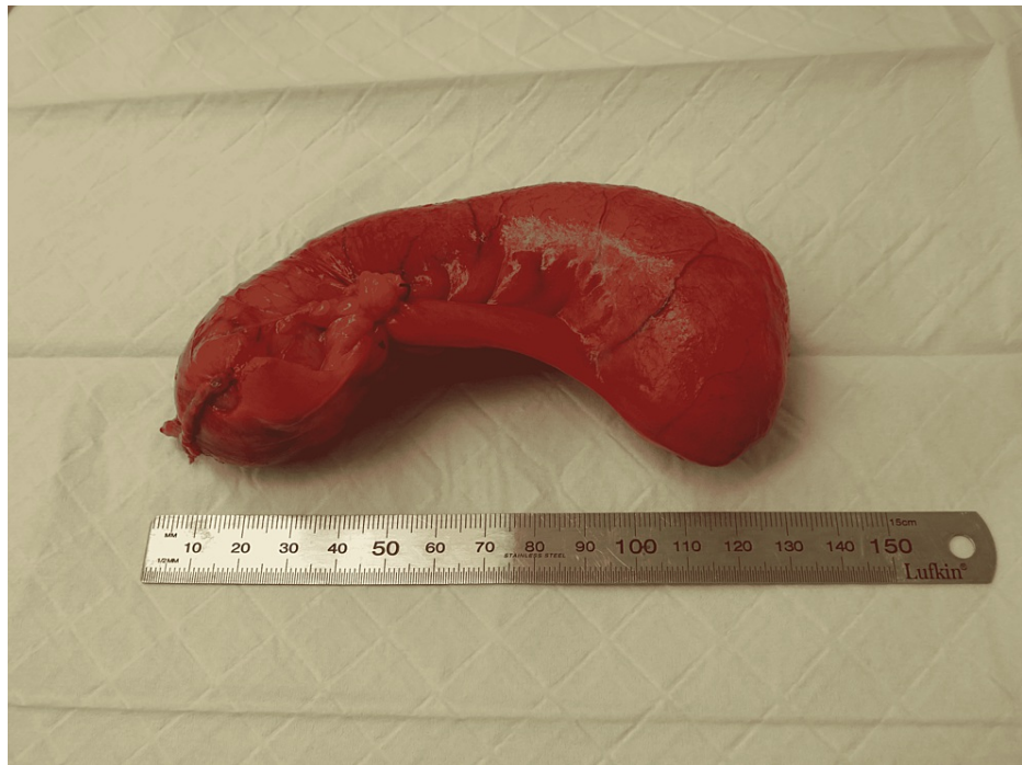
FIGURE 2: Intact removed appendiceal specimen.