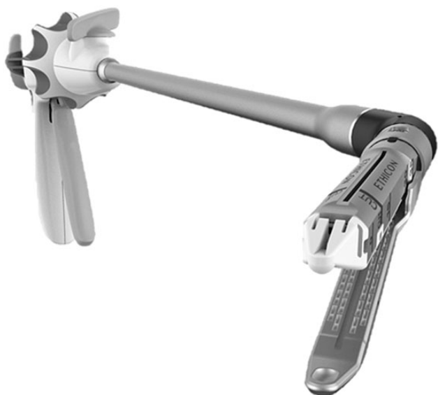
Figure 1: ECHOLON FLEX™ powered vascular stapler with advanced placement tip.

the PVS well suited for vascular applications at the pulmonary hilum deep in the pleural space.